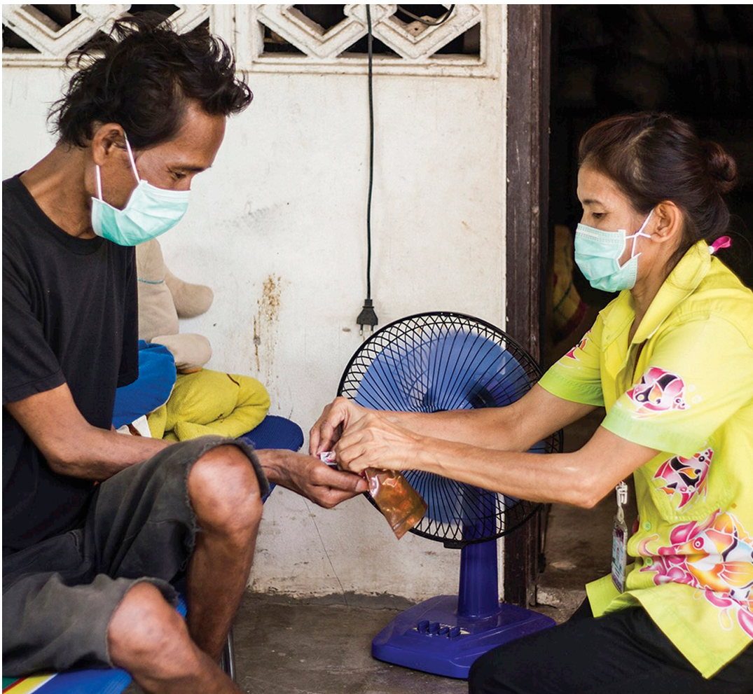
Multi-Drug Resistant Tuberculosis (MDR-TB) patient in Rayong province, Thailand, receiving therapy during a home visit. Improper use of antibiotics in chemotherapy of drug-susceptible TB patients is a key cause of MDR-TB, a more virulent form of TB. The WHO estimates that there were about 450,000 new MDR-TB cases in the world in 2012.

Taking into account the number of people dying as a result of TB every year, as well as the social and economic impact of the disease, it is key to ensure TB prevention and care are fully recognised as a part of UHC, as well as included in the basic health services provided. By reaching out to those people who currently lack access to healthcare, UHC has the potential to accelerate progress in the fight against TB. Complementary efforts to address the social and economic determinants of TB, as well as increased financing for research and development (R&D), are crucial if we are to reach zero TB deaths, and prevent new infections.